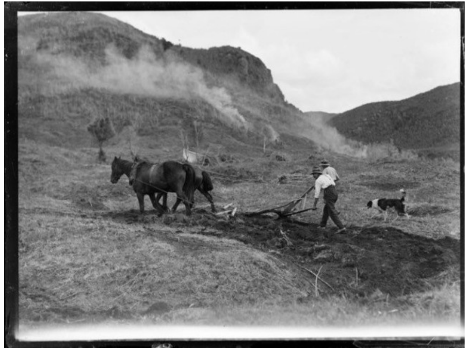
Ploughing with horses, King Country.

Many farms during the 1950 had a mixture of tractors and horses, the tractors doing the ploughing and heavy cultivations, while the horses did the lighter row scoop work, hay racking and feeding out stock. I left school at 16 in 1952, the year of King George sixth's death when Elizabeth the second became Queen, and